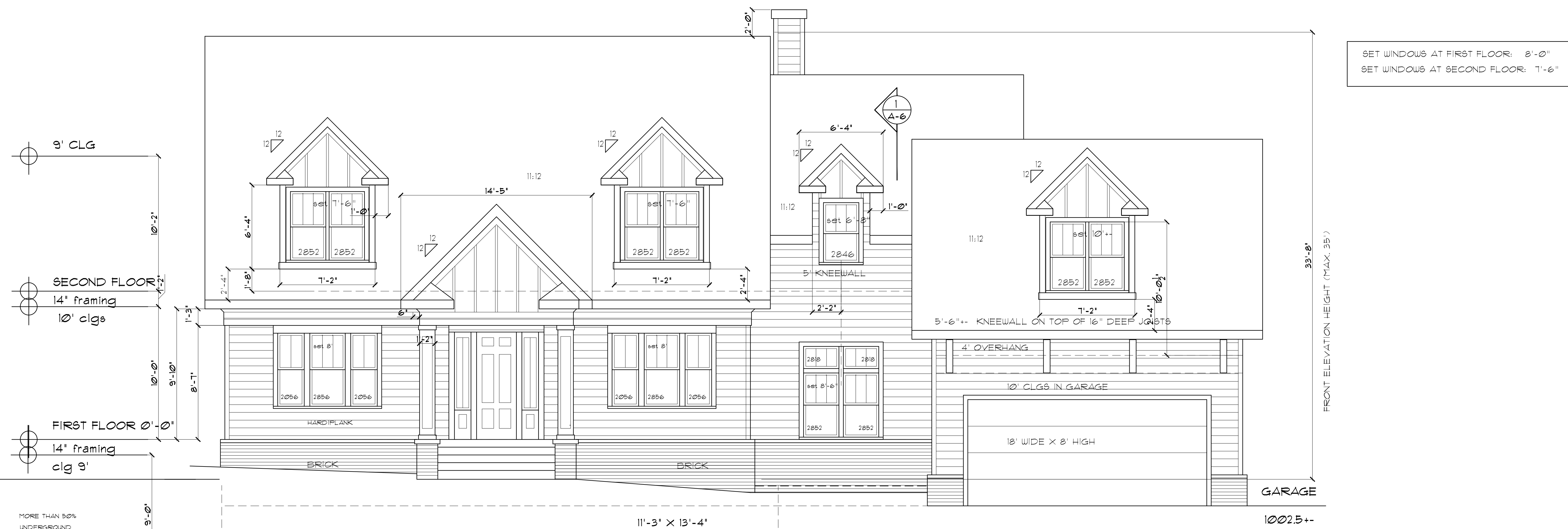
(SOUTH ELEVATION) PROPOSED FRONT ELEVATION SCALE: 1/4" = 1'-0"

9' CLG 10'-2" SECOND FLOOR 14" framing 10' clgs 10'-0" 9'-10" 8'-11" FIRST FLOOR 0'-0" 14" framing clg 9' 9'-0" MORE THAN 50% UNDERGROUND (BASEMENT LEVEL) BASEMENT LEVEL